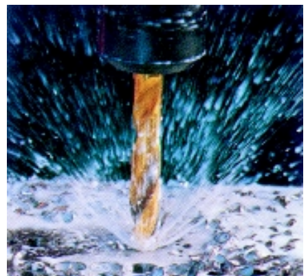
"COMPETITIVE MANUFACTURING IN 2001" ANNOUNCEMENT AND CALL FOR PAPERS